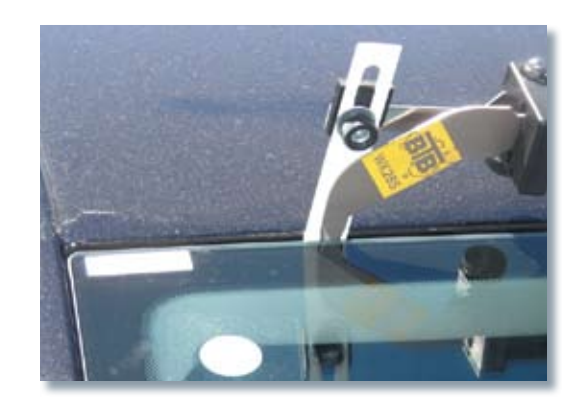
For additional protection & corner regions